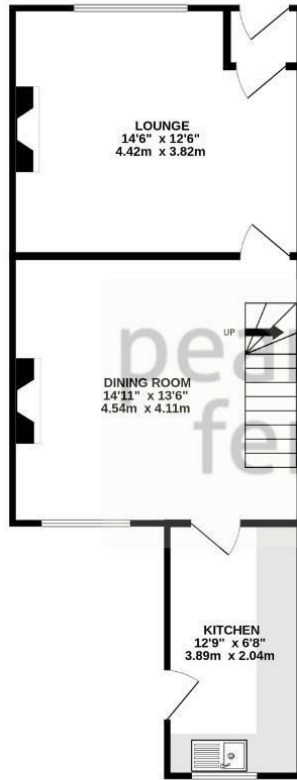
GROUND FLOOR 453 sq.ft. (42.1 sq.m.) approx.