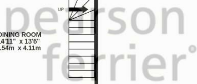
TOTAL FLOOR AREA : 819 sq.ft. (76.1 sq.m.) approx.

Whilst every attempt has been made to ensure the accuracy of the floorplan contained here, measurements of doors, windows, rooms and any other items are approximate and no responsibility is taken for any error, omission or mis-statement. This plan is for illustrative purposes only and should be used as such by any prospective purchaser. The services, systems and appliances shown have not been tested and no guarantee as to their operability or efficiency can be given. Maple Hill, Macclesfield, CO22